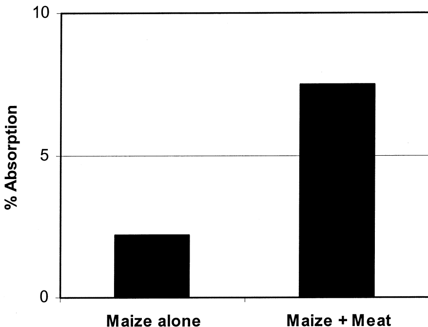
Fig. 1. Absorption of non-heme iron from maize meal in the absence and presence of meat [4].

grains, nuts, and seeds, can also form insoluble complexes with iron, zinc, or calcium; thus diminishing the availability of these nutrients. Tannins found in high levels in tea leaves, coffee, red wine, spinach and rhubarb, also inhibit absorption of iron, zinc, and calcium [6–8]. In contrast, meat contains iron and zinc bound to heme protein, which is readily incorporated into blood cells of the body. The presence of heme protein in a meal enhances the absorption of zinc and iron from cereal and other plant sources [8,9] ( Figures 1 and 2 ). It must be noted that the levels and bioavailability of micronutrients are not equivalent in both meat and milk. Milk, if consumed with meat, reduces the bioavailability of iron and zinc because of the high calcium and casein content that form insoluble complexes with iron and zinc [8,9]. Table 2 lists common foods and the levels of important nutrients in these foods, both plant-based and derived from animals.